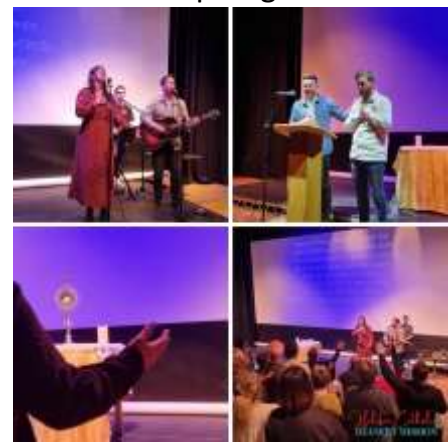
Tuesday 16 th May