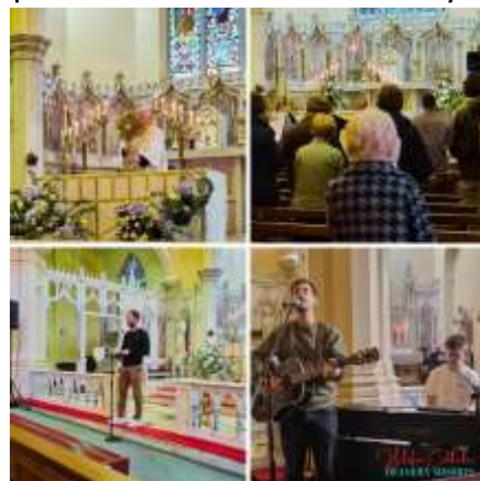
Monday 15 th May