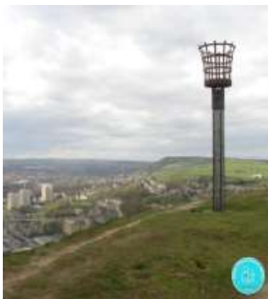
Thursday 11 th May

This was a Mission for all and met the needs of all. We are a Catholic family of all ages and I think all ages could relate to some part of it. For me Wednesday was the most inspiring.