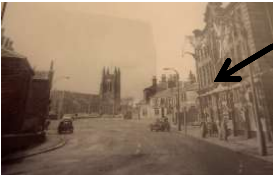
The Cooperative Hall