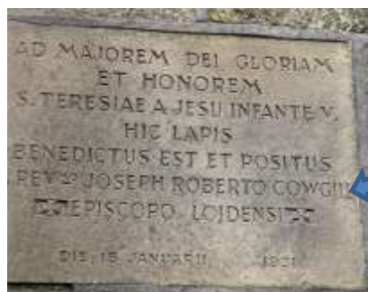
This is in the wall to the left of the Church door.