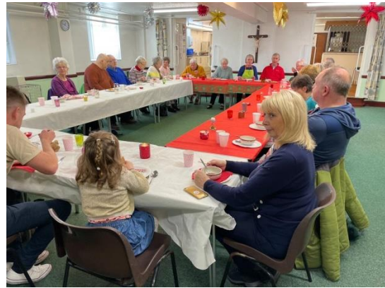
Ready for lunch